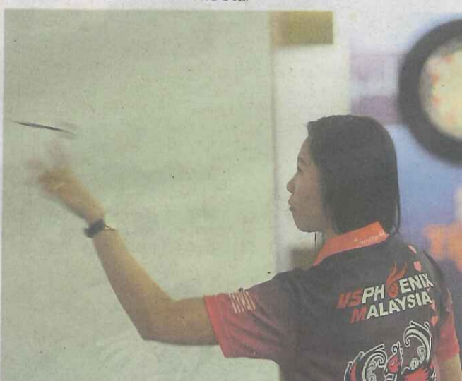
The event attracted over 700 contestants from 13 countries.