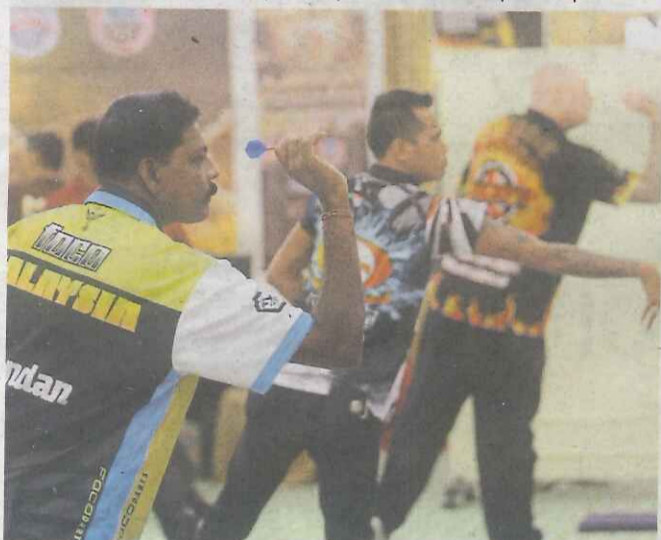
Players in action during the knockout stages.