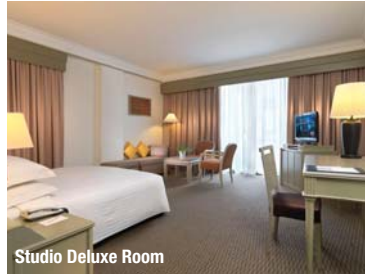
Studio Deluxe Room