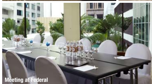
Meeting at Federal