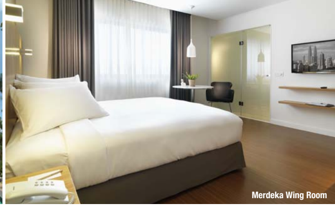
Merdeka Wing Room