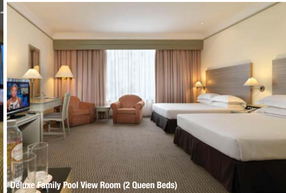
Deluxe Family Pool View Room (2 Queen Beds)